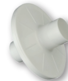
Part No. S4201