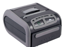
Part No. S2000