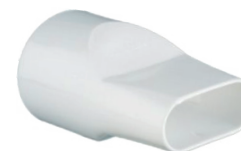
Part No. S4205