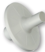
Part No. S4202