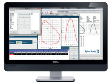
Part No. S3000